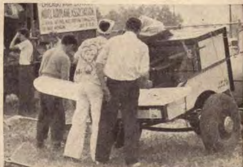
A simple "box" type trailer of small size will conveniently serve smaller model clubs. This one was built of scrap lumber and mounted on a junk yard wheel and axle assembly.

In planning your trailer, it is somewhat less trouble, even though heavier, to use the rear axle of the car as the trailer axle. This eliminates the necessity for welding or pinning the steering mechanism in a neutral position. The driveshaft need merely be disconnected at the juncture with the differential.—Harold W. Kulick.