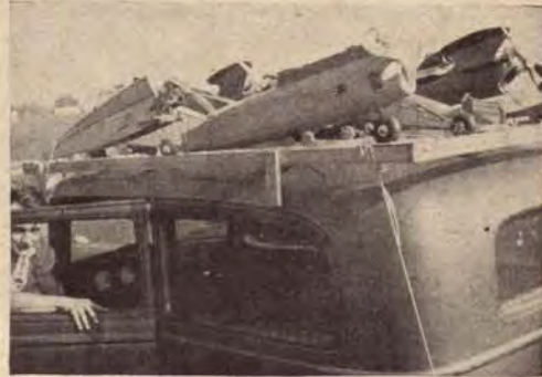
The family car can be quickly converted into a model airplane trailer by the method shown above. A pine frame covered with chicken wire is tied to the car top to carry the planes. Be sure to put padding under the frame to prevent scratching the top.

ance, as the wheels may simply be left exposed as shown. One of the best materials for the covering of the body is waterproof plywood. The various waterproof building boards, however, will serve nearly as well. In some instances even cloth is used, doped as in airplane construction. Although this saves weight and expense, it is not as strong or as durable as the other coverings mentioned.